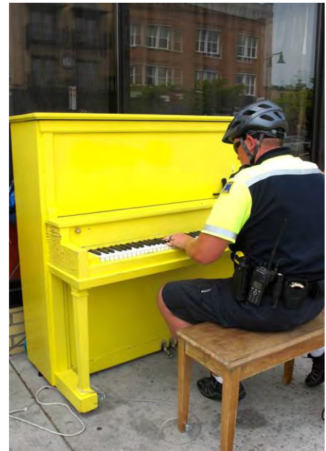
Missoula Police Officer playing a tune.