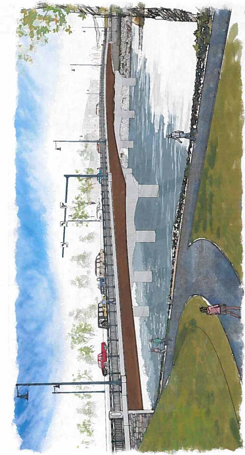
Russell Street Bridge - Looking North