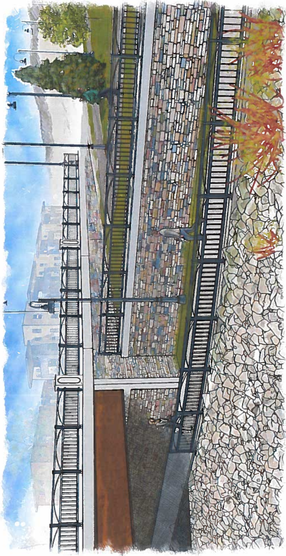
Russell Street Bridge - Looking North North Abutment - Custom Stained Rock Pattern