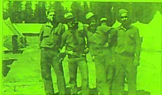
Fort Missoula District CCC Corpsmen, Swan Lake, MT 1935

Headquartered at Bldgs. T-310 and T-316 at Ft. Missoula, Montana, adjacent to the Historical Museum at Ft. Missoula. From I-90, take U.S. Hwy 93 Exit south to the junction of Reserve St. and South Ave. Proceed west on South Ave., turn left at Fort Missoula Entrance, right on Col. Burt St., left on Gen. Foster Ave.