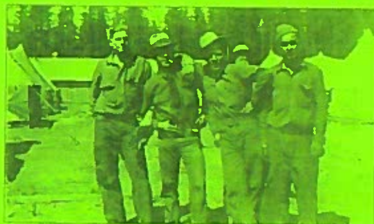
Fort Missoula District CCC Corpsmen, Swan Lake, MT 1935

Headquartered at Bldgs. T-310 and T-316 at Ft. Missoula, Montana, adjacent to the Historical Museum at Ft. Missoula. From I-90, take U.S. Hwy 93 Exit south to the junction of Reserve St. and South Ave. Proceed west on South Ave., turn left at Fort Missoula Entrance, right on Col. Burt St., left on Gen. Foster Ave.