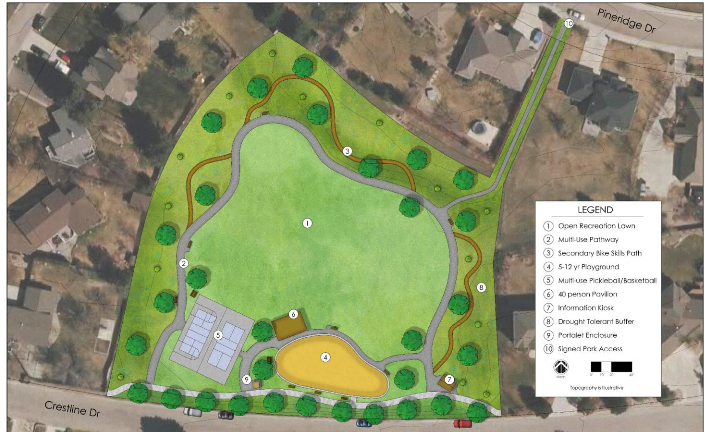
Conceptual Master Plan April 2019